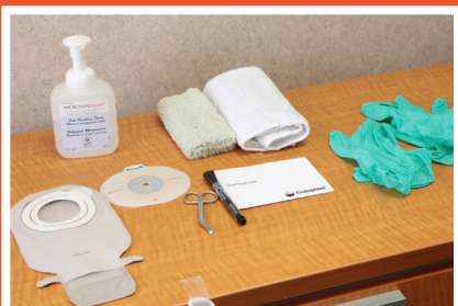
1 Gather supplies