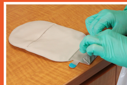
12 Close ostomy bag