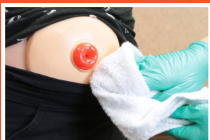
5 Pat skin dry