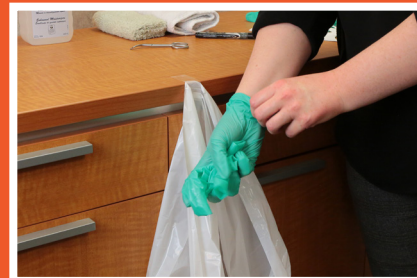
15 Dispose of gloves and garbage