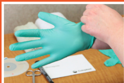
2 Clean hands and apply gloves*