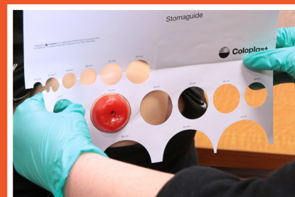
7 Measure size of stoma