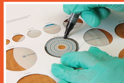
8 Draw stoma outline onto flange