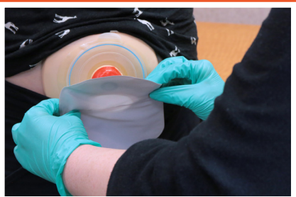
13 Attach ostomy bag to flange