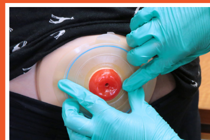
11 Apply new flange and press down around stoma