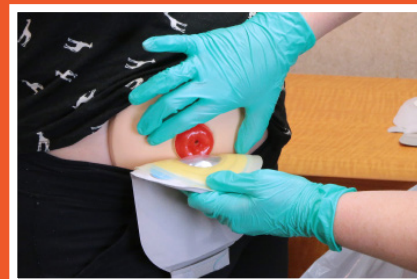
3 Remove old ostomy appliance