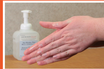
16 Clean hands

* If you are a patient you do not need to wear gloves. Ensure that you wash your hands well once you have completed your appliance change.