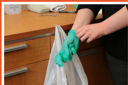
6 Remove gloves, clean hands, apply new gloves